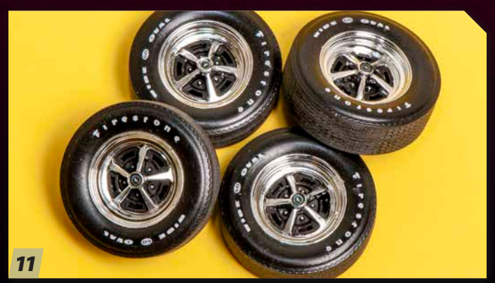
Sand the tire treads to simulate wear. Then mask the treads and spray Tamiya Semigloss Clear (No. X-35) on the sidewalls before applying the Raised White Letter (RWL) decals. On the wheels, paint the recessed areas flat or semigloss black and carefully brush semigloss clear on the slightly less shiny spoked areas.