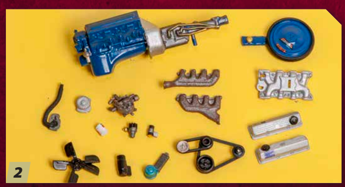
Detail the engine with metallic gray and gold on the fuel pump; a misting of rust-colored primer on metallic gray manifolds; flat yellow for the ignition coil front cap; flat aluminum and a dark wash on the alternator; metallic green/blue mix on the steering pump; and metallic gold on alternator pulley and air cleaner vacuum module.

The complete Cleveland V8 is installed in the engine compartment. Paint the V-shaped shock-tower reinforcement semigloss gray. This replicates the paint Ford reportedly made from collected overspray from the paint booths and mixed together for reuse on some components. Generally gray, there were hints of other colors in it, including green, blue, purple, and pinkish red.