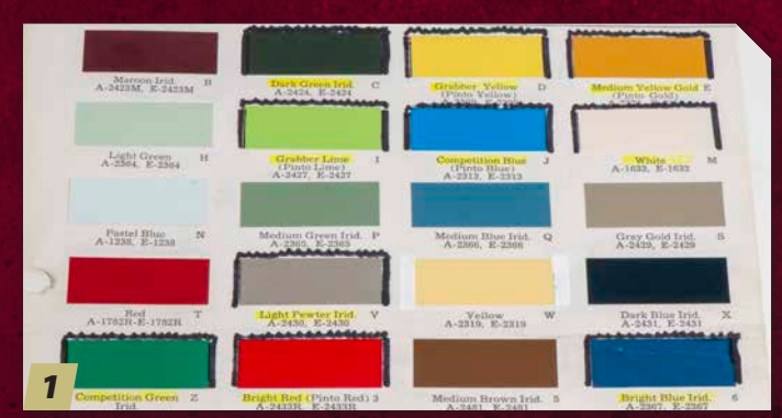
At the start of production, the Boss 351 was restricted to these 11 factory colors: Black (Code A), White (M), Bright Red (3), Light Pewter Metallic (V), Bright Blue Metallic (6), Dark Green Metallic (C), Grabber Lime (I), Grabber Yellow (D), Grabber Blue (J), Grabber Green Metallic (Z), Medium Yellow Gold (E).