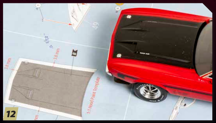
Revell includes a scale illustration of the hood blackout area. Use Tamiya Semigloss Black (No. X-18) for this area. The edges are included as a glossy decal in the kit. Cut the border decal into three pieces (slicing at the hood pin locations), apply the front, followed by the two sides for better alignment. FSM