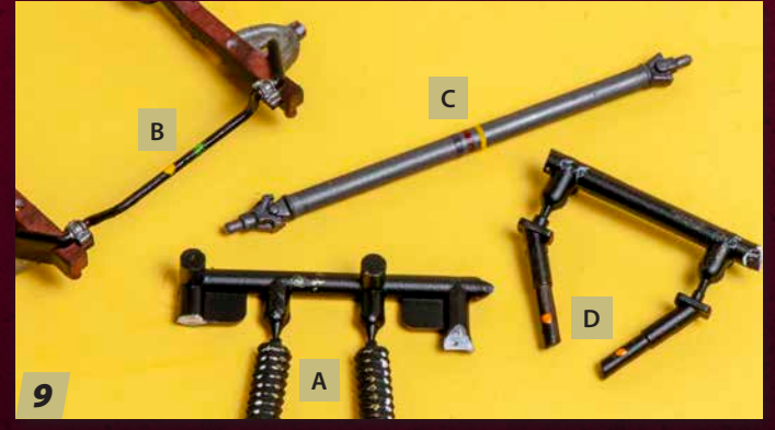
Replicate factory component markings: A ) gold and white stripes on the front suspension coil springs; B ) yellow and apple green paint dabs on the front stabilizer bar; C ) narrow violet/red/yellow stripes (in that order, front to back) near the center of the driveshaft; and D ) orange dabs on the rear shocks.