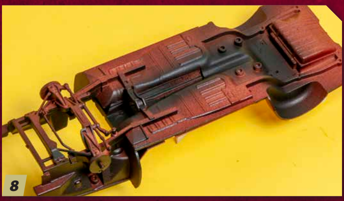
Most 1971 Mustangs wore a rust-colored primer on their underbodies. Mist the exterior body color along the outer edges of the underbody for paint-booth overspray. Simulate partial factory undercoating and front-end, wheel-well, and lower rocker-panel blackout by airbrushing flat black a bit haphazardly in the areas shown and along the outer edges of the underbody.

In Step 19 of the Mustang instructions, the locator pins for parts 38 and 39 fit tightly to the underbody (Part 8). Drill the locating holes (shown with toothpicks) with a slightly larger bit to ease assembly. Make sure the parts are fully seated and flush along their mating surfaces when you glue them.