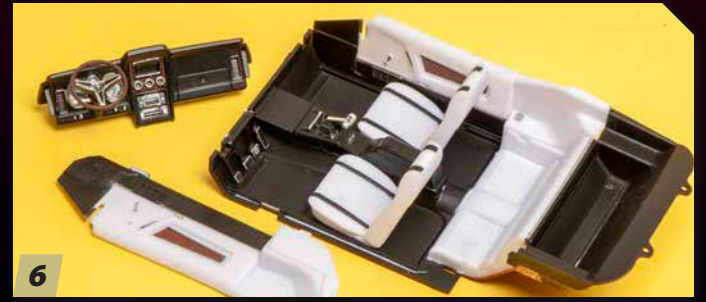
The Revell wood-grain decals go on well with the help of Microscale Micro Set and Sol. Before applying the gauge decals, paint the recessed areas around the gauges silver. For the chrome accents throughout the interior, use a fine-tipped Molotow Liquid Chrome paint marker.