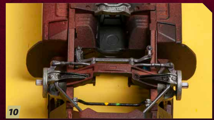
While it's convincing out of the kit, you can improve the simplified front suspension by cutting the tie rod assembly away from the cross member and by replacing the kit brakes with photo-etched metal disc brakes, calipers, and backing plates.