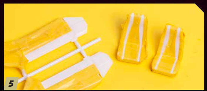
If you do a White or Vermillion Décor interior, this is where you mask for the black lower doors and the contrasting seat accents. It's important to note the seat accents appear only on the front buckets, not the rear seat.

The optional Boss 351 Interior Décor Group was offered in 11 color combinations: single-color Black, Medium Blue, Medium Ginger, Green, and Vermillion (as seen in the cutout); black with vermillion, gray, or white front seat accents; white with black carpet, lower doors, and instrument panels and white front seats with either black or gray accents; vermillion interiors had black carpets, lower doors, and instrument panel and vermillion front seats with black accents.