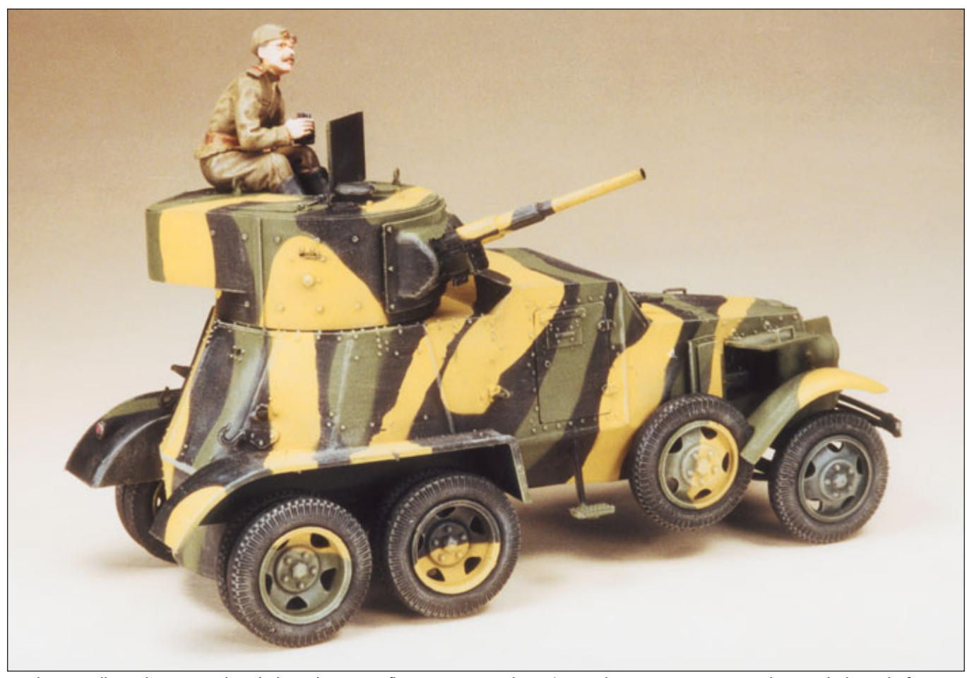
Cookie Sewell got the snappy banded tricolor camouflage pattern on this 1/35 scale Soviet BA-6 armored car with the aid of a secret weapon that should be in every armor modeler's arsenal: Silly Putty.