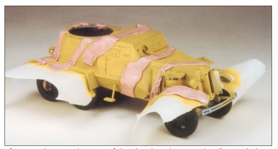
After giving the BA-6 a base coat of Floquil mud, Cookie put on the Silly Putty (looks like bubble gum, doesn't it?) mask before spraying the next color. The tape keeps the overspray away from the undersides of the fenders and hull to minimize the need for touchups later on.

over these items, but it won't pull them off when it's removed.