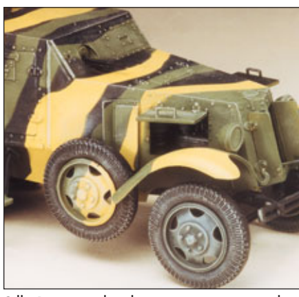
Silly Putty masks eliminate seepage and give nice sharp color definition. Cookie got good results here dry-brushing with Floquil Old Concrete. It's a light-yellowish tan that simulates summer dust and blends well with all three camo colors.

After the paint was dry, cleanup was very simple: I just peeled off the Silly Putty, rolled it up, and put it back in its egg. It separates gently from the model and usually doesn't take hand grabs or similar photoetched metal parts with it. You can use it for several models, but on future projects pay attention to the colors the Silly Putty carries with it. Keeping it in the egg - which you forgot to do as a kid and later found the putty either stuck