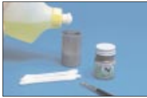
1 Liquid dishwashing detergent and water are added to Polly Scale acrylic paint to make the "sludge wash."

For example, at a recent modeling club meeting, a couple of 1/48 scale models of