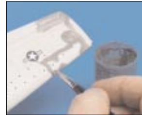
2 After the model has been overcoated with clear gloss, the sludge wash is applied to all recessed panel lines.

SOURCE Microbrushes Microbrush Corp., 1376 Cheyenne Ave., Grafton, WI 53024, 262-375-4011, www.microbrush.com