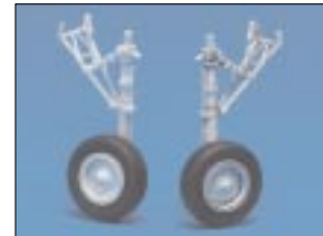
8 Compare the bland, sterile main landing gear on the left to the "sludge washed" unit.