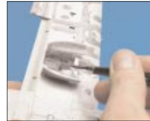
3 The sludge goes into the cockpit, wheel wells, and other deep depressions to simulate shadows.