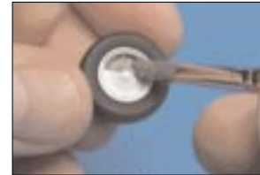
5 More sludge is applied to the wheels and helps define the rims, hubs, and bolts.