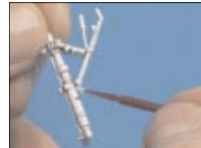
7 To remove the sludge from tight recesses, use the tiny ball of absorbent fuzz on a Microbrush.