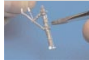
4 Even the landing gear struts get sludged! Medium or dark gray works best on white.