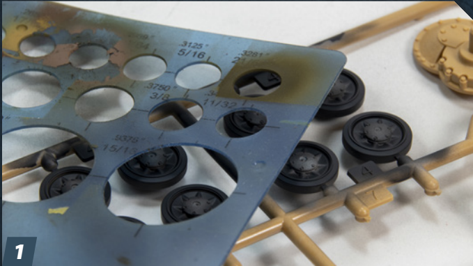
1 Many tanks and APCs have five, six, or seven pairs of road wheels on each side. That makes two dozen or more tires to be painted. Make the process easier by using a circle template, which you can find at art supply stores.