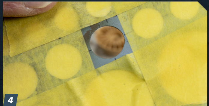
4 Before airbrushing the body color on the wheels, cover the surrounding holes on the template with tape to avoid getting paint on nearby parts.