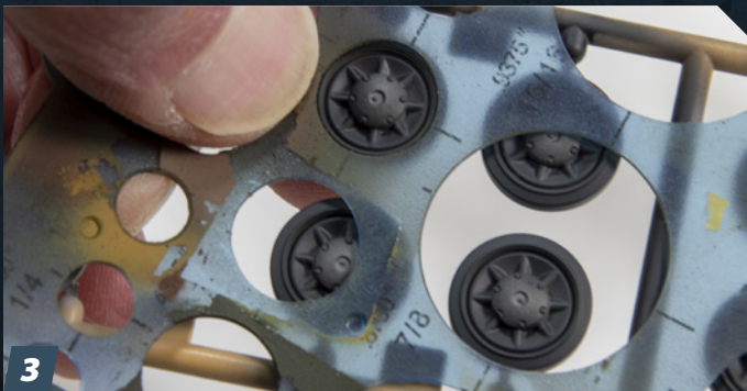
3 Holding the circle template over the road wheels, find the opening that covers the tire while leaving the wheel and rim exposed. Don't worry too much if you can't find an exact match; later washes and dry-brushing will cover overspray or shortfall.