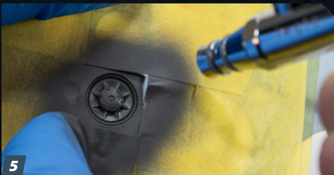
5 Next, it's a simple matter of holding the template over each wheel and spraying the camouflage color. With one wheel done, lift the circle template and move to the next wheel and repeat until they are all painted. Smaller holes can also be used to paint return rollers.