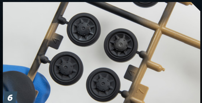
6 In less than five minutes, I painted all 32 road wheels on this Panzer IV with crisp demarcations between the tires and rims. Now they are ready to go on the model! If you build tanks and AFVs a lot, in no time you'll be a pro at painting them using this technique! FSM