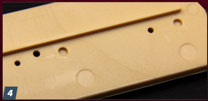
Recessed knock-out marks such as these can be dealt with in several ways.