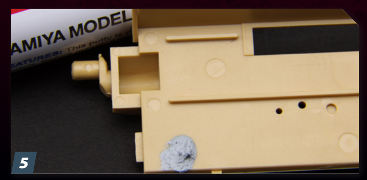
First up: filling the recessed mark with putty. This method works best on relatively shallow ejector-pin marks. Currently my favorite brand of putty is Tamiya Basic Type (No. 87053). It sands easily and feathers nicely. Apply with a sculpting paddle, toothpick, or scrap plastic.