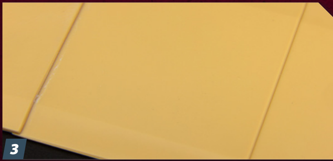
All gone! Raised marks are typically the easiest to remove unless they're surrounded by detail. If the work area is tight, a flat chisel blade in a hobby knife can be used to carefully scrape the raised disk down rather than a file. Just be careful not to gouge the plastic.