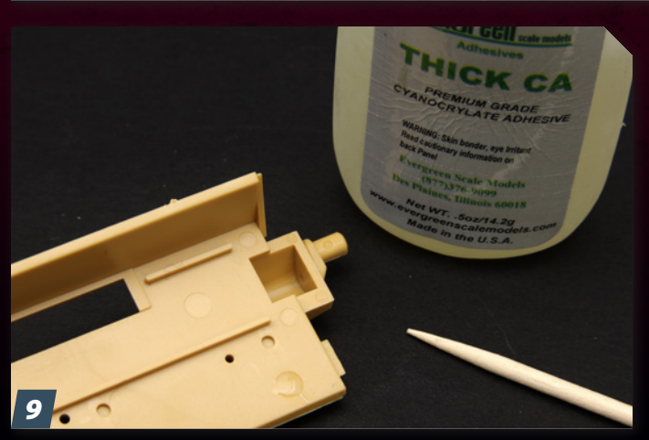
Lastly, you can fill knock-out marks with superglue. I like to use a thick, gel-type superglue combined with an accelerator for fast and rock-hard filler.

Often, using a plastic disc to fill an ejector-pin mark needs little or no putty to finish, though you'll still probably have to sand it smooth. In the end, it leaves a clean and structurally sound filler