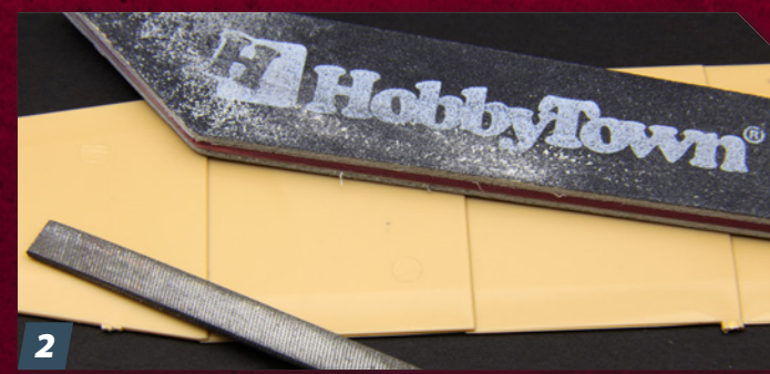
To remove the marks, start with a flat modeling file. Because it's rigid, the flat file allows you to keep the surface true and even. Remember to hold the file flat and apply even pressure. When the mark is gone, finish with a fine-grit sanding stick.