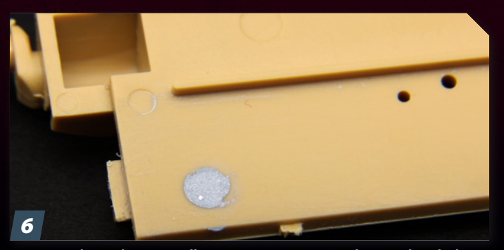
Putty sands easily. I typically use water on my sanding stick to help keep down dust. Also, in my experience, wet sanding seems to speed the process and provides a smoother finish to the putty.