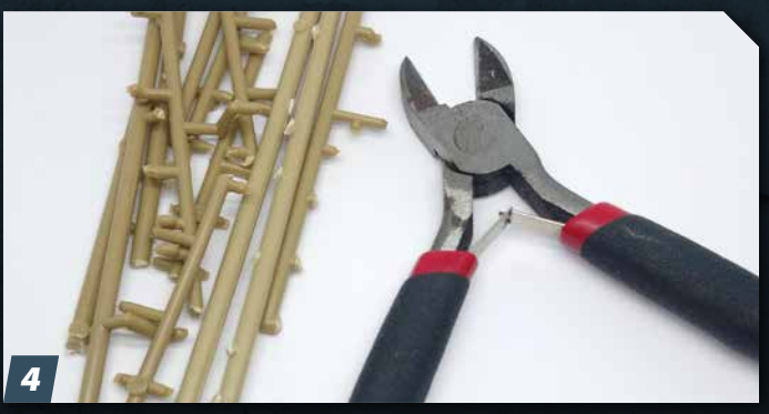
If you need trees with thinner trunks, trim lengths of sprue of any unwanted branches.