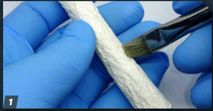
For trees with larger trunks, make a core (balsa wood works well) wide at the bottom and tapered toward the top and wrap it in tissue paper soaked with white glue.