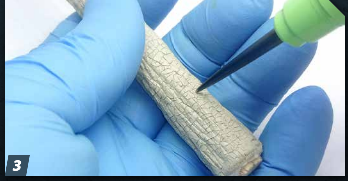
Use a scribing tool to create realistic contours in the bark running vertically along the length of the trunk. This further simulates a tree trunk's naturally undulating surface.