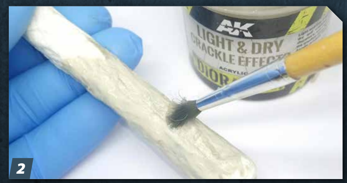
After the tissue and glue have dried, apply AK Interactive Light & Dry Crackle Effects (No. AK8033) with a wide, flat brush. When the acrylic paste dries, it will have a naturally cracked surface, like bark of a maple, oak, or similar tree.