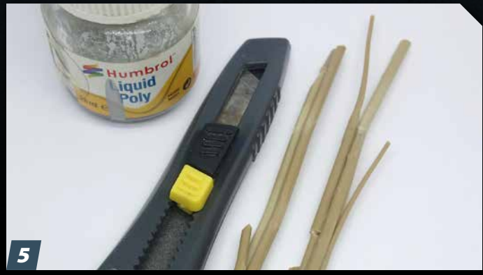
Glue the lengths of sprue together with liquid plastic cement. Feel free to bend them into natural-looking shapes, or even heat and stretch the ends to get tapers. Be creative!