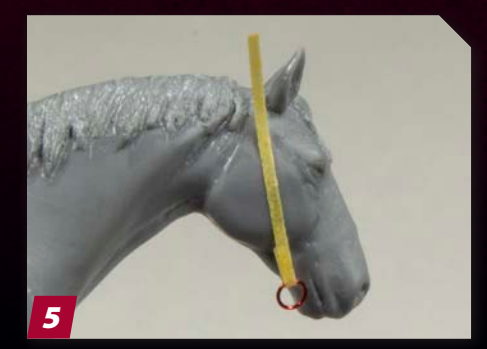
The same stickiness helps with placement. You can reposition the tape as often as necessary while working to add all the components.