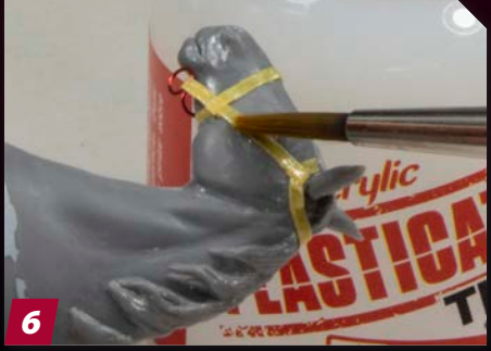
A thin coat of Ammo by Mig Jimenez Acrylic Plasticator, in this case, the thick version (No. A.MIG-2076), helps lock everything down and provides a smooth finish for painting.