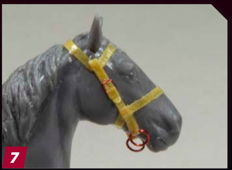
I added adjustment buckle details using wire coiled around a small square mandrel then made additional tape straps before coating everything with Plasticator again. FSM