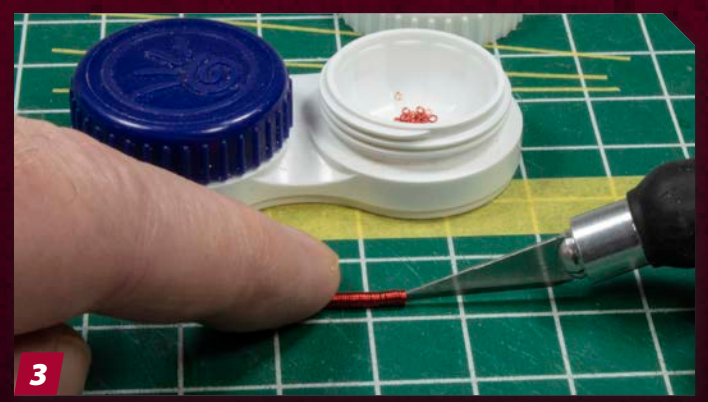
Once you have several coils around the shape, slide it off and place it on your cutting mat. Sliding a knife blade into the center of the coil and cutting will provide many rings. I transfer these to an old contact lens case for safe keeping.