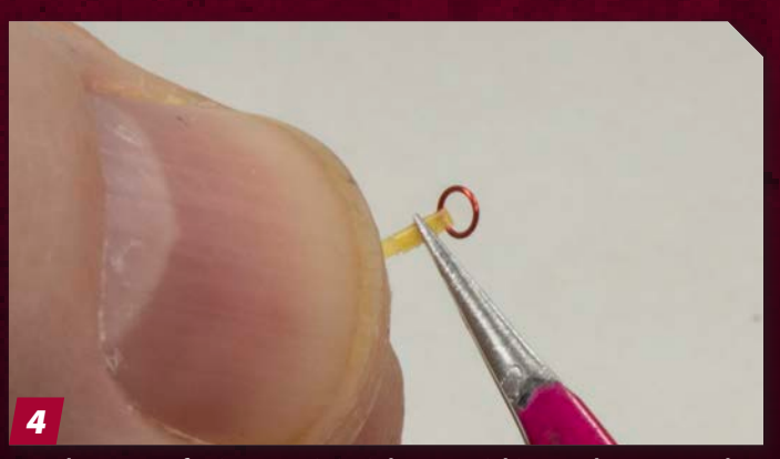
An advantage of using tape is its inherent stickiness. The tape can be put through the ring and will be held in place as you fold over the end to hold the ring.