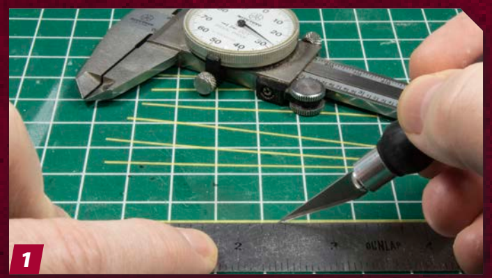
Using tape to replicate straps, seat belts, etc., is simple and effective. I measured the necessary width and cut several lengths of Tamiya tape with a hobby knife guided by a steel ruler.